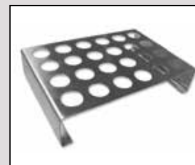
JPT Stainless Steel Jalapeno Pepper Tray 11-1/4" x 6"