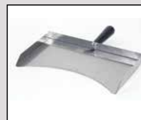
ACT Stainless Steel Ash Cleaning Tray