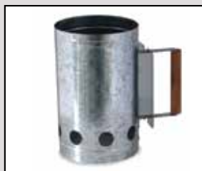
CCS2 Chimney Charcoal Starter