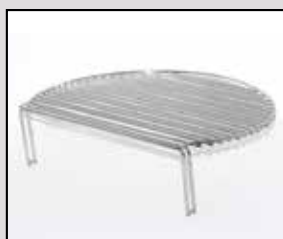
DCG Bravo Double Commercial-grade Stainless Steel Cooking Grid Used to expand your cooking area