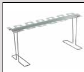
CLWR Vertical Stainless Steel Chicken Leg & Wing Rack