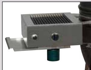
Easy slide out drip tray allows for easy cleaning