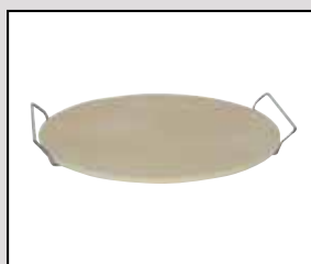
PZST13 12" Round Ceramic Pizza Stone with Wire Holder