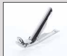
GG Bravo Grid Lifter Safely & easily remove Used to elevate cooking