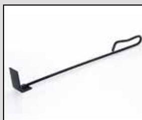
ART Bravo Ash Removal Tool Makes cleaning