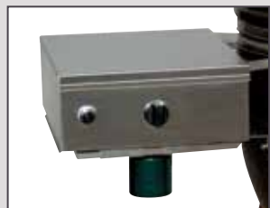
Comes with a stainless steel cover for protection and versatility