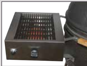
Infrared burner heats up in under 4 minutes