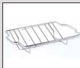
RR3 Nickel-Plated Steel Roast Rack 12" x 8"