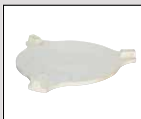
HDP Bravo Ceramic Heat Deflector Plate Turns your Bravo into an