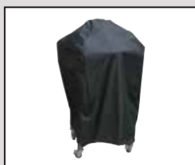
BC1 Embossed Bravo Grill Cover Made to fit the Bravo Portable Model Kamado Grill

Enhance your grilling experience with accessories that have been designed to work with your Bravo Kamado Grill.