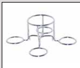
CCR Beer Can Chicken Roaster